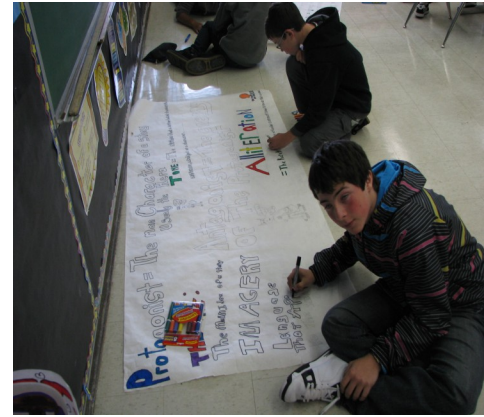
Students in Mr. Hammer's grade 8 Language Arts class make posters about story elements that get posted onto the classroom wall for the entire year...great ownership of learning!

These results, along with teacher assessments, are used to develop learning opportunities for all students that will challenge them to succeed!