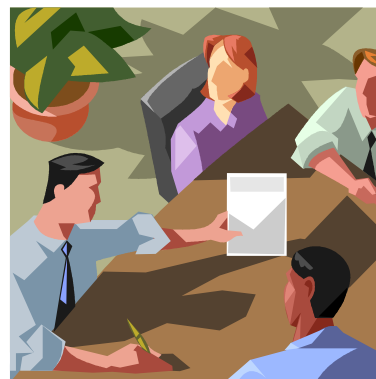
Parent Council brings together school and community to create the best school possible

Our next meeting will be October 21 @7pm in our library. We will discuss which of these areas we want to focus on first, and develop a plan to make it happen.