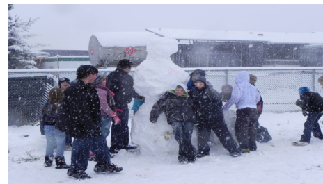
Students working together can build great things...even in the snow!

We are proud of our school and our students!