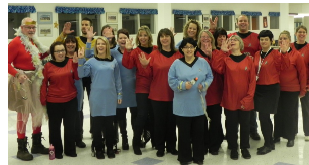
The crew of the USS Enterprise, along with an alien, made their way to our school for Halloween!